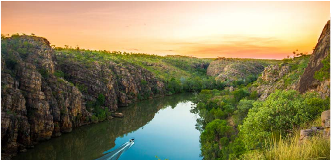
Nitmiluk (Katherine Gorge), Nitmiluk National Park NT

Hotel: Coinda Lodge Kakadu, JABIRU NT [3.5 star rated]