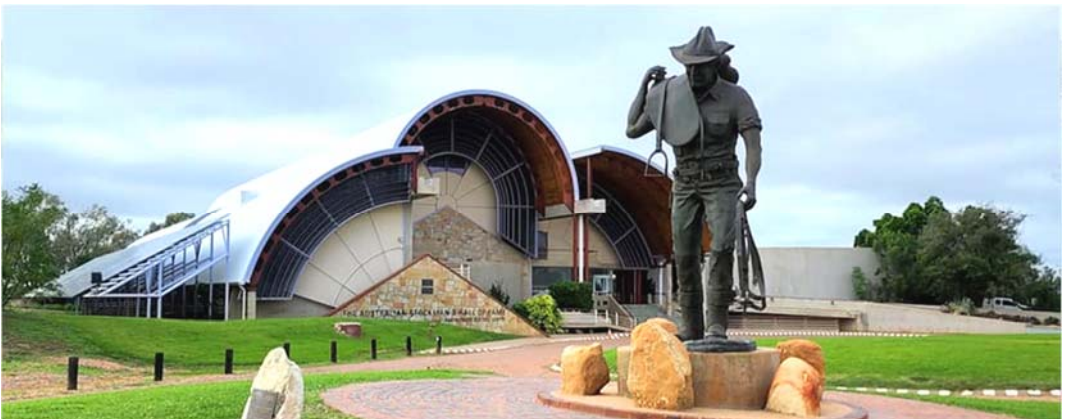
Australian Stockman's Hall of Fame, Longreach QLD

Hotel: Boulder Opal Motel, WINTON (2 nights)