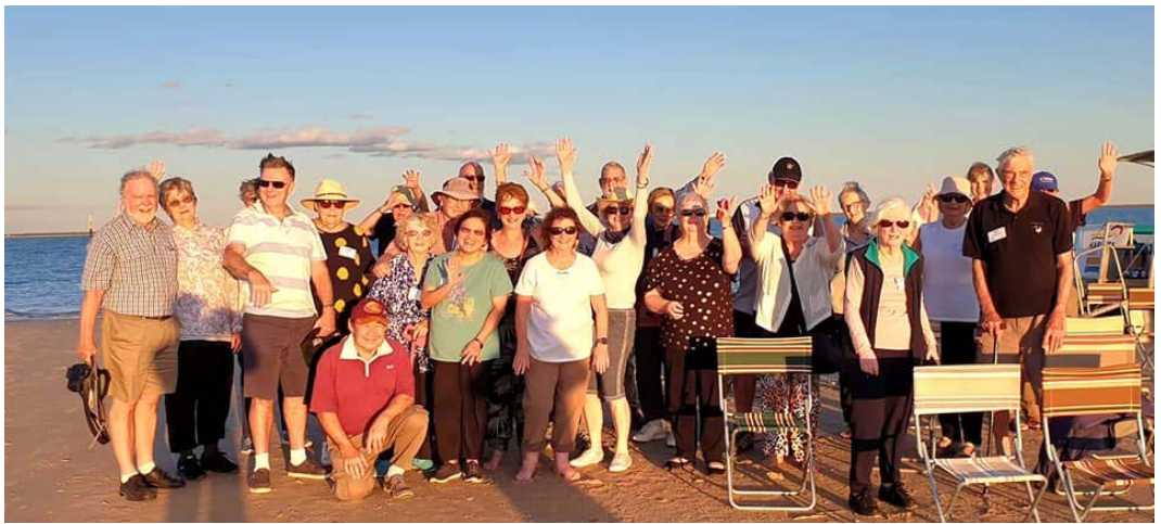
Sand Island Sunset Dinner & Cruise, Karumba QLD