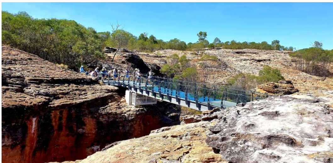
Glass bridge walkway at Cobbold Gorge, Forsyth QLD