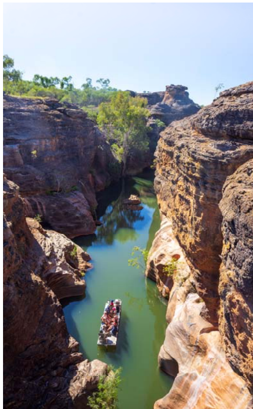
Cobbold Gorge, Forsyth QLD