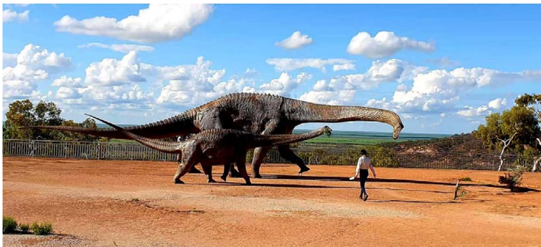
Australian Age of Dinosaurs Museum, Winton QLD