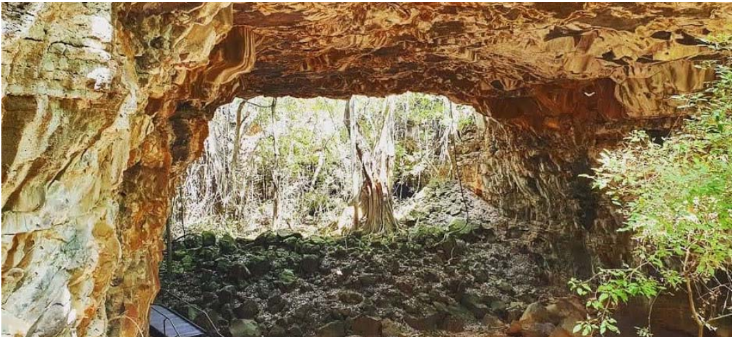
Archway Explorer Tour—Lava Tubes, Undara Experience QLD